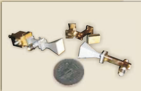
TX / RX UNIT